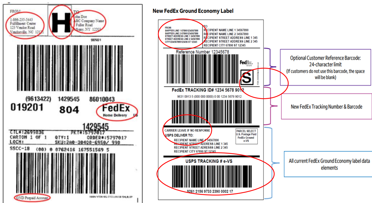
Diagram G – Belk Ship Label Sample