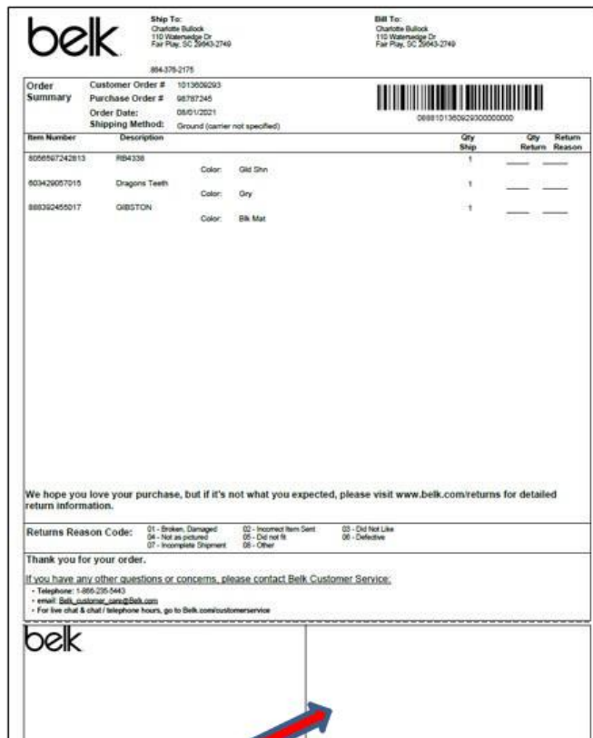
Diagram F – Belk Branded Packing List